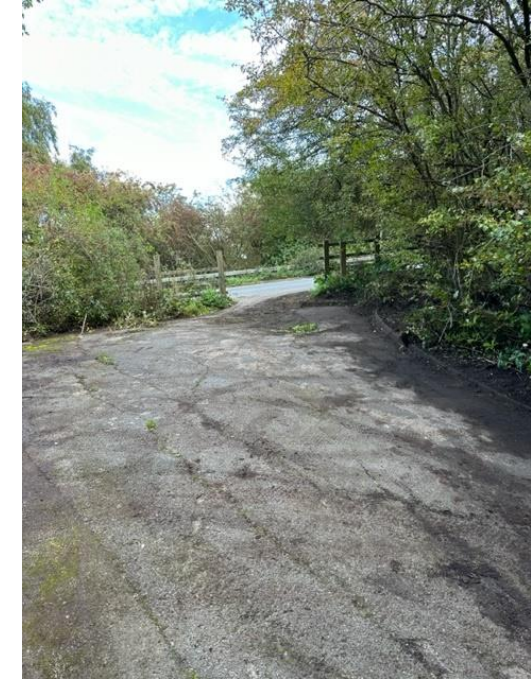
Location: Tinsley Lane North